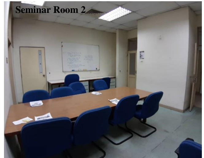
Figure 1. The current status of the two seminar rooms.