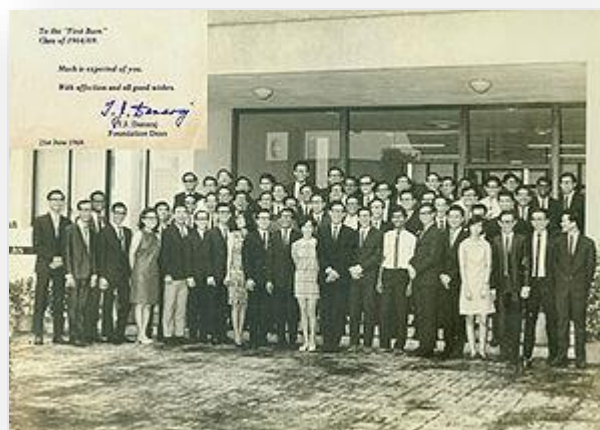
FIRST BATCH- 1969

To this end, the Government agreed and the Ministries of Education and of Health provided the necessary capital funds. In 1962, a Dean for the Faculty of Medicine was appointed.