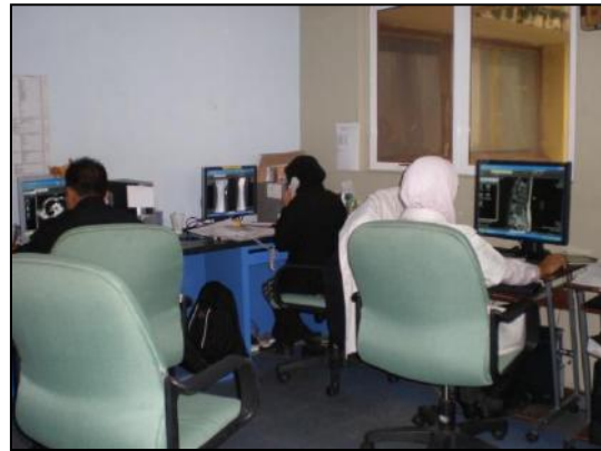
PACS Control Room