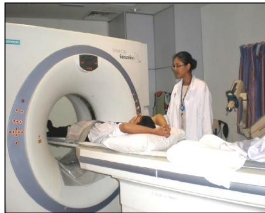
Three Computed Tomography Scanners