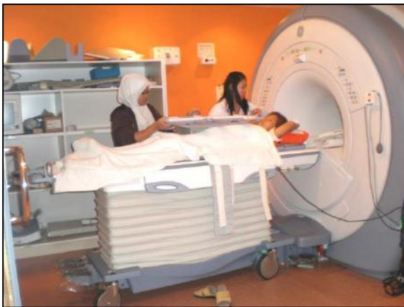
3 MRI scanners: