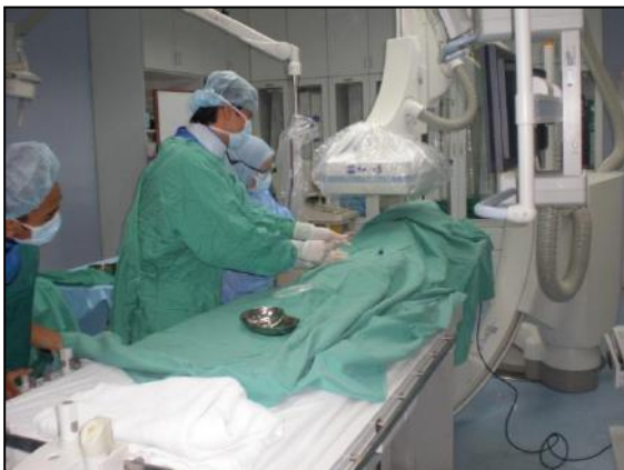
2 Angiography Sets

Philips CX50 Integrated Ultrasound Biplane Siemens Syngo Multimodality Single Plane