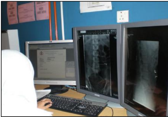
3 Reporting Rooms