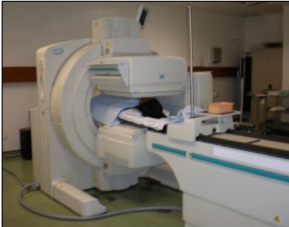
Philips FD20 Single Plane